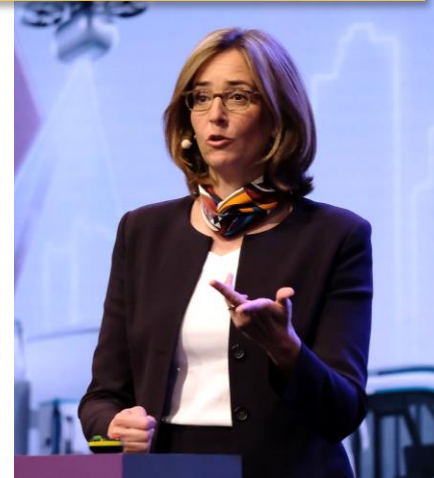
IAA TRANSPORTATION 2022