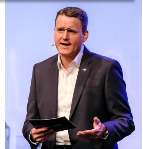
IAA TRANSPORTATION 2022