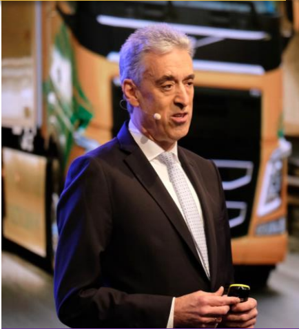
IAA TRANSPORTATION 2022