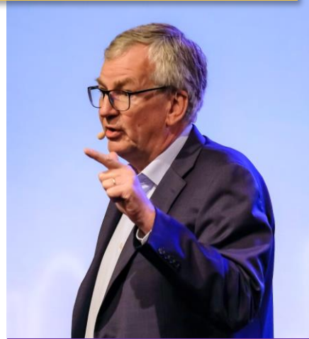
IAA TRANSPORTATION 2022