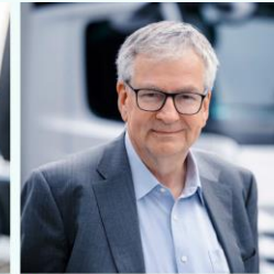
Martin Daum Chairman of the Board of Management Daimler Truck AG